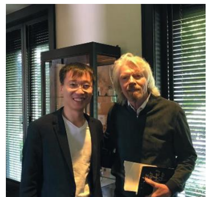
With Virgin America Co-Founder, Richard Branson