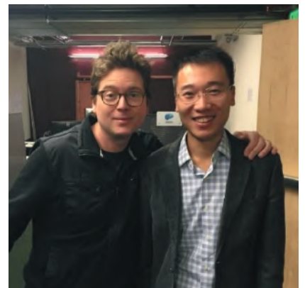
With Twitter Co-Founder, Biz Stone