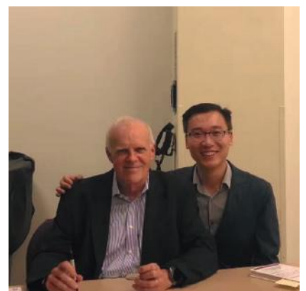
With Chairman of Alphabet (Google Holding Company) John Hennessy, the 10th president of Stanford University