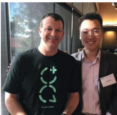
With Whatsapp Co-Founder, Brian Acton