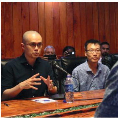
With CEO of Binance CZ