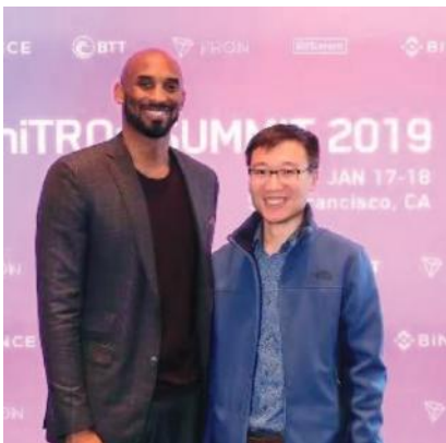
With Kobe Bryant