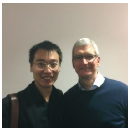
With CEO of Apple Incorporated, Tim Cook